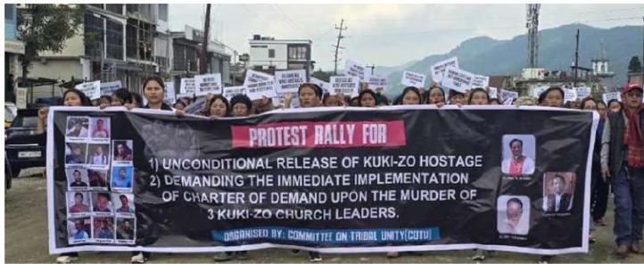
Mounting tension: Protesters demand release of Kuki hostages and justice for three slain church leaders on Saturday.

The protest rallies coincided with the extension of a 48-hour total shutdown called by the Kuki Inpi Manipur, the apex body of Kukis in the State amid outrage over the continued "targeted persecution" of the community.