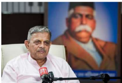
RSS leader Dattatreya Hosabale speaking to PTI in New Delhi.

With regard to the relationship with Pakistan, matters stray into a territory that is more dynamic, and affected by both internal and external events. The RSS's views have been quite consistent for a long time; therefore, governmental intervention, which also depends on immediate circumstances, may not usually follow the same trajectory. What the comments suggest is that whenever or if ever Mr. Modi seeks to initiate dialogue with Pakistan, he will have political cover from the ideological parent of the BJP.