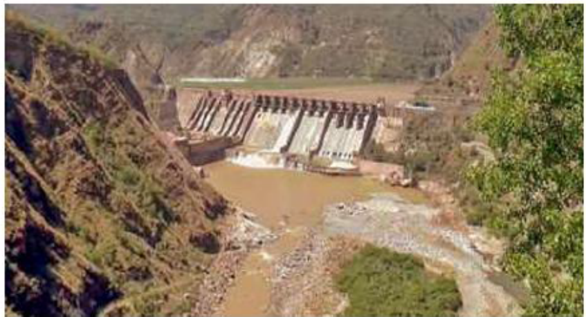
A dam on the Indus river system in Reasi, J&K.

No official communication of the award is publicly available on the website