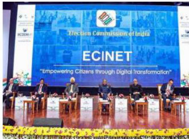
Chief Election Commissioner Gyanesh Kumar with the two Election Commissioners at the ECINET launch on January 22.

cards will be applicable for categories of persons authorised by EC to enter counting centres and halls, including ROs, Assistant Returning Officers (AROs), counting staff, technical personnel, candidates, election agents and counting agents, among others.